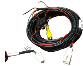
26' Extension Cable