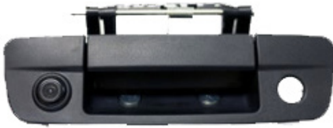
CDR-02 Tailgate Handle Camera