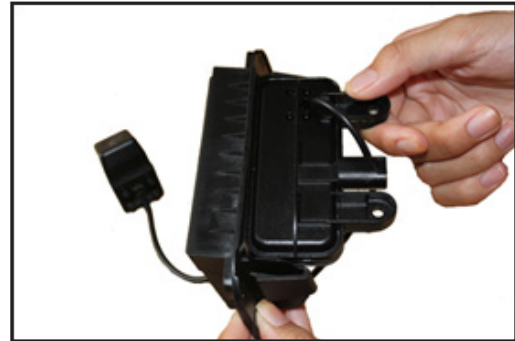
4. Position the CMB-15T base to OE trunk handle and align the screw holes.