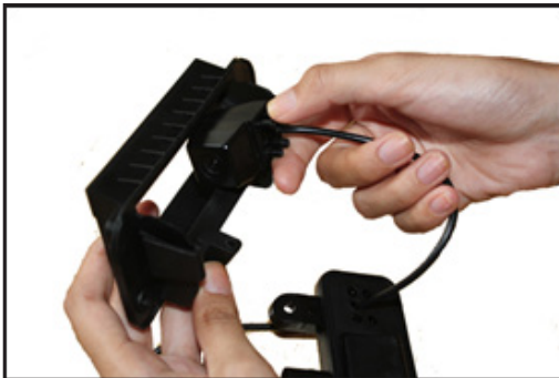
3. Slide the camera from the back side of the OE trunk handle.