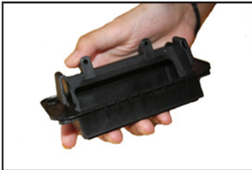
1. Remove OE trunk handle and remove the OE trunk release switch.