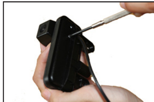
2. Remove the 4 screws holding the CMB-15T camera.