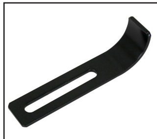
5. Single Slot Mounting Brackets x 2