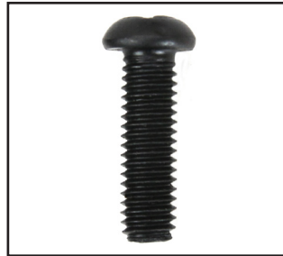
2. M6 x 1.0 Screws x 12