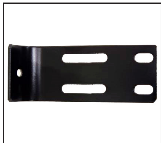
4. Mounting Brackets x 2