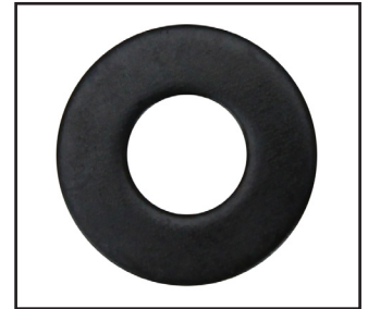
3. M6 Washers x 12