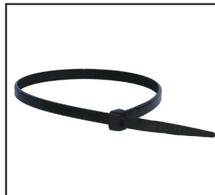
6. Zip Ties