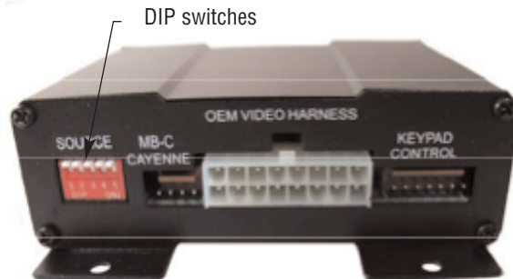
Inputs and Controls

Consult the documentation that came with your video component to determine which of these is appropriate for your installation.