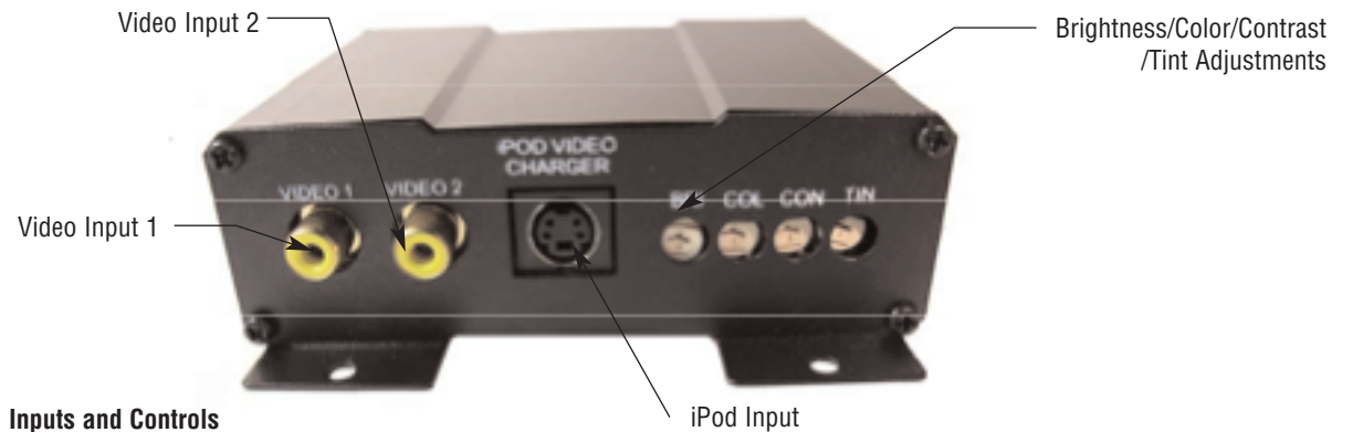
Inputs and Controls